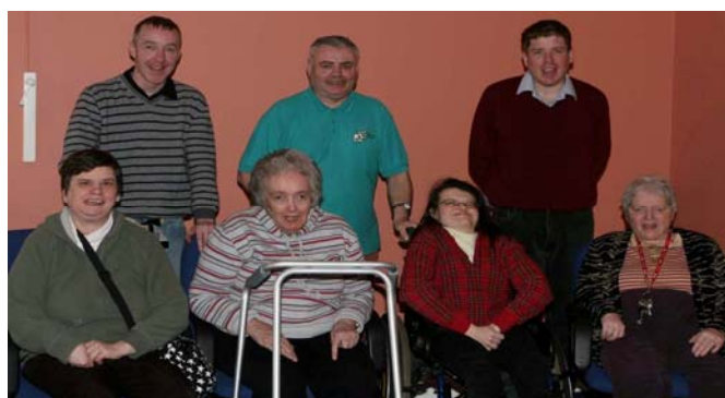
Members of the Walkinstown Association Advocacy Group at one of the regional workshops held in Dublin.

A number of consultative workshops have been carried out to provide a platform for people with intellectual disability to meaningfully participate in all aspects of the research design and development of the study. The workshops also make sure that we include the views and opinions of people with intellectual disability when we are making decisions.